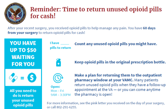
Figure 1. Card mailed to patients in the treatment group one week after surgery

involving two reminder cards. One card is given to the patient when they receive their prescription opioid pills, and another is mailed to the patient approximately one week later. The cards were designed to make information available to the patient at a time when they can take action, and to motivate action by framing the incentive as money waiting to be claimed. 4